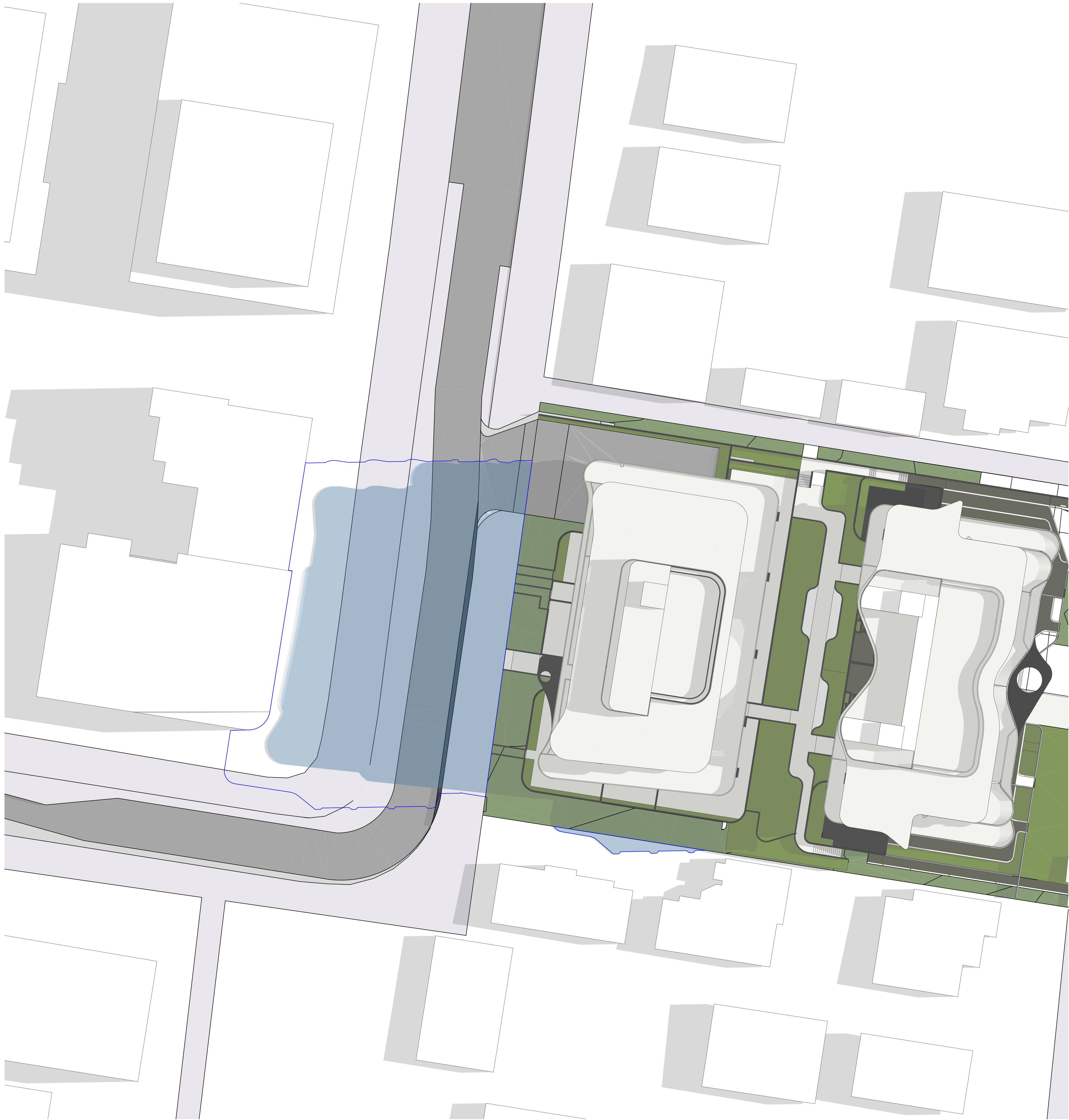
Winter Solstice 12pm